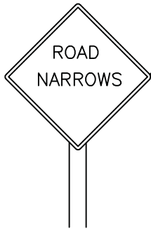
SIGNAGE Not to Scale

SIGNAGE - LOCATE 50' IN ADVANCE OF INTERSECTION-SEE SIGNAGE DESIGNATION BELOW